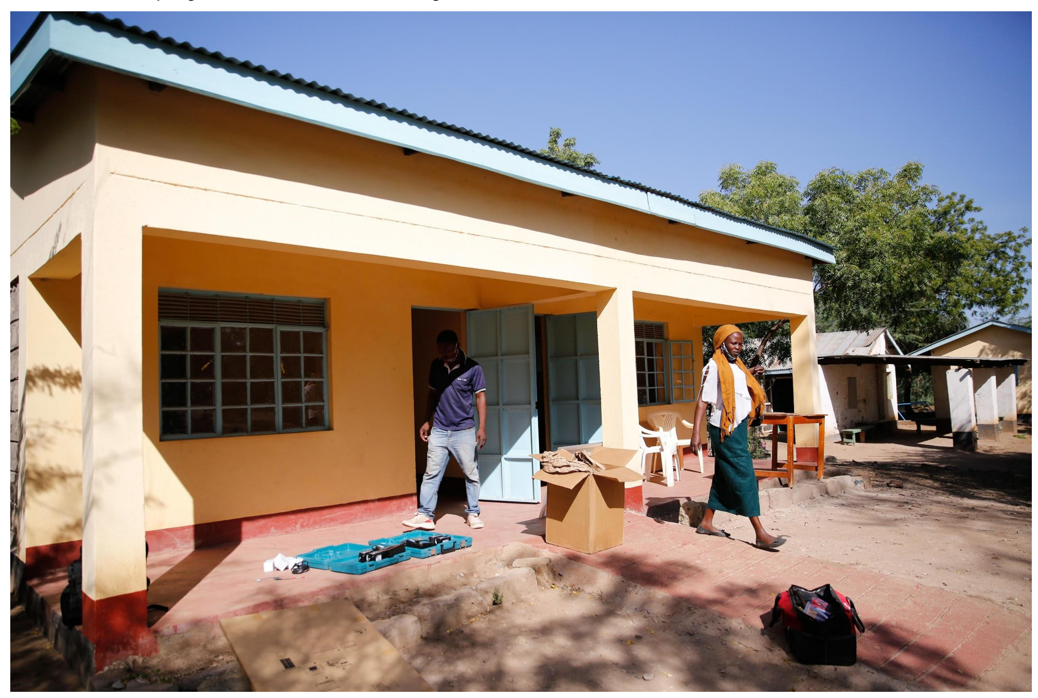
Jesuit Refugee Services, Kenya