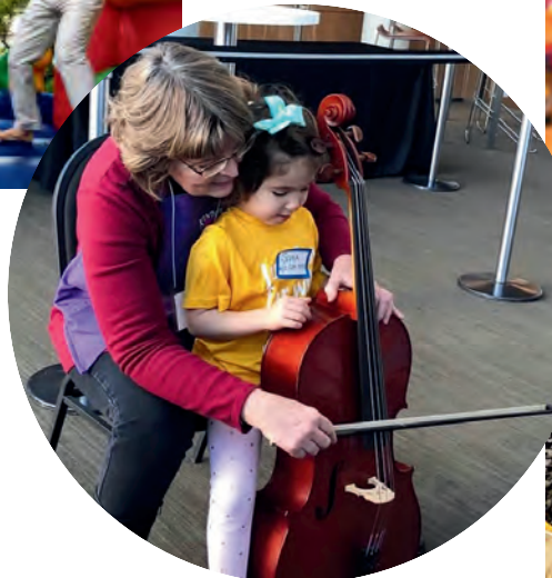
OFF-SITE AND IN-HOUSE FIELDTRIPS