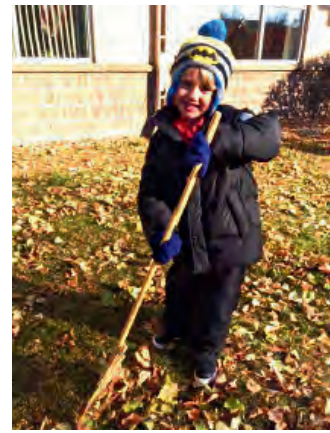
COMMUNITY OUTREACH & SERVICE