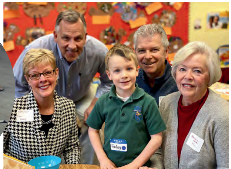
GRANDPARENTS, PARENTS & FRIENDS JOIN IN "THE FESTIVAL OF FAMILY & FRIENDS"