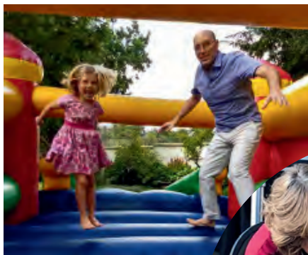
FAMILY NIGHTS AND COMMUNITY EVENTS