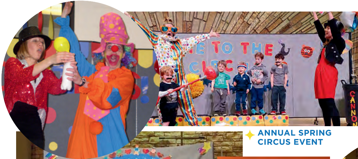
ANNUAL SPRING CIRCUS EVENT

Circus, Outreach, Festival of Family & Friends, Christmas, Fieldtrips, Graduation